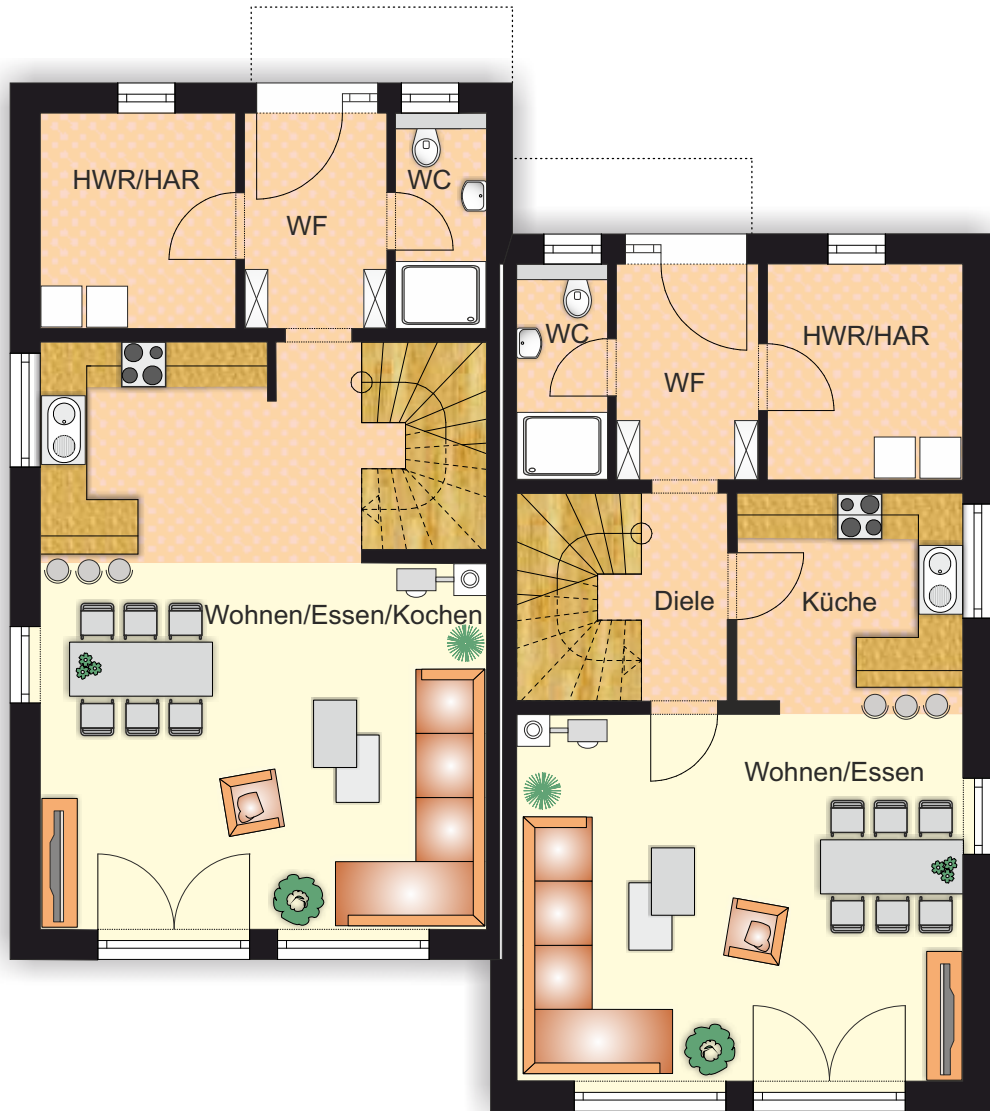
Typ 91.68B Erdgeschoss